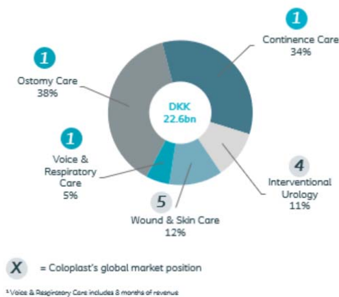
Group revenue 2021/22 by segment 1